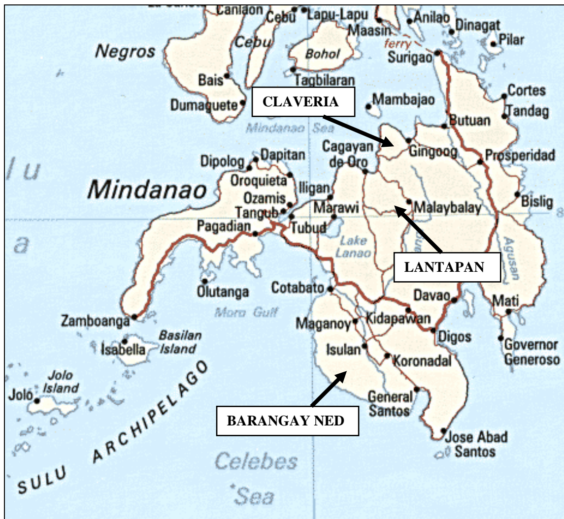
Figure 1 Location of principal landcare sites in Mindanao, Southern Philippines