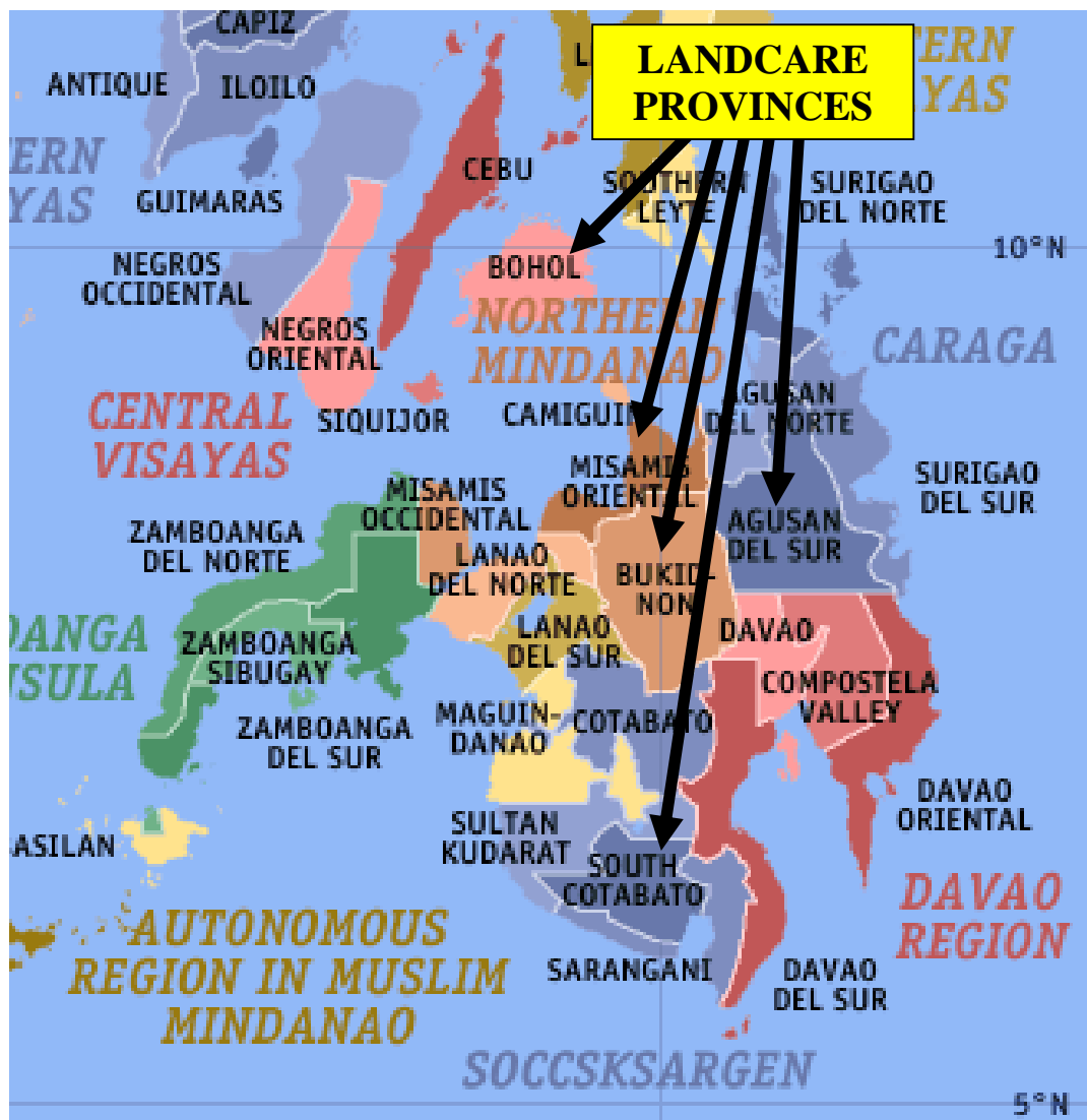
Fig. 2 The five provinces in which Landcare is currently being promoted, with support from ICRAF (Bohol, Misamis Oriental, Bukidnon), SEARCA (South Cotabato), and CRS (Agusan del Sur).