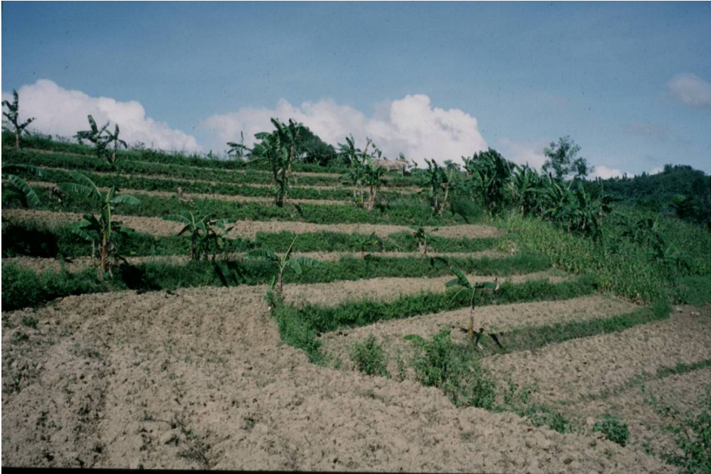
Fig. 4 Natural vegetative strips (NVS) are established by ploughing on the contour and leaving an unploughed strip at intervals to act as a barrier to the movement of soil down the slope. This technique has been found effective in controlling erosion on continuously cultivated land, resulting in the formation of terraces within about three years. Unlike SALT, there is no need to establish hedgerows from seed or cuttings, and the labour and skill requirements are substantially reduced. As seen here, farmers can then begin to enrich NVS with crops like bananas or tree crops.

farmer leaders, at the suggestion of one of the ICRAF facilitators, decided to form a farmer organisation to promote conservation farming, particularly the NVS system, within the Claveria community. The organisation was named the Claveria Landcare Association (CLCA), the name “Landcare” being taken from a logo painted on the ICRAF vehicle used to transport farmers during field visits.