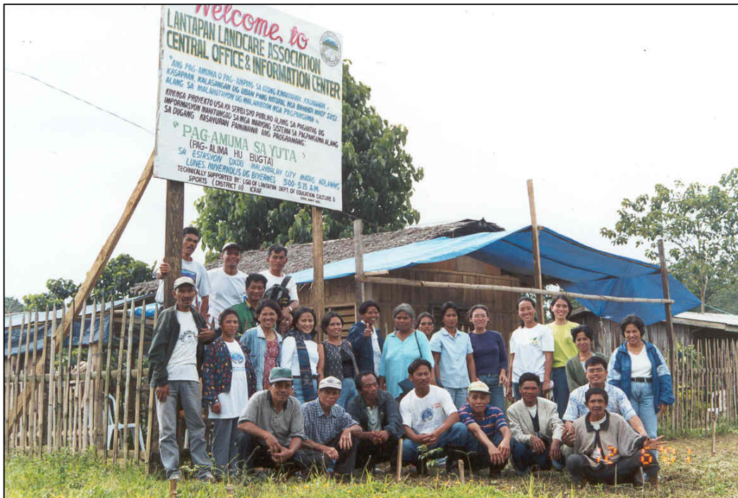
Fig. 6 Members of the Lantapan Landcare Association together with Landcare facilitators in front of the first Landcare centre (now relocated to Sungco).

There was rapid formation of Landcare groups, soon growing to 62 local groups with 840 registered members (though in practice membership was quite informal), linked in the Lantapan Landcare Association (LLCA) (Fig. 6). These groups were an important source of information on conservation practices for their local community and encouraged members and others to work together, especially in the establishment and maintenance of communal Landcare nurseries.