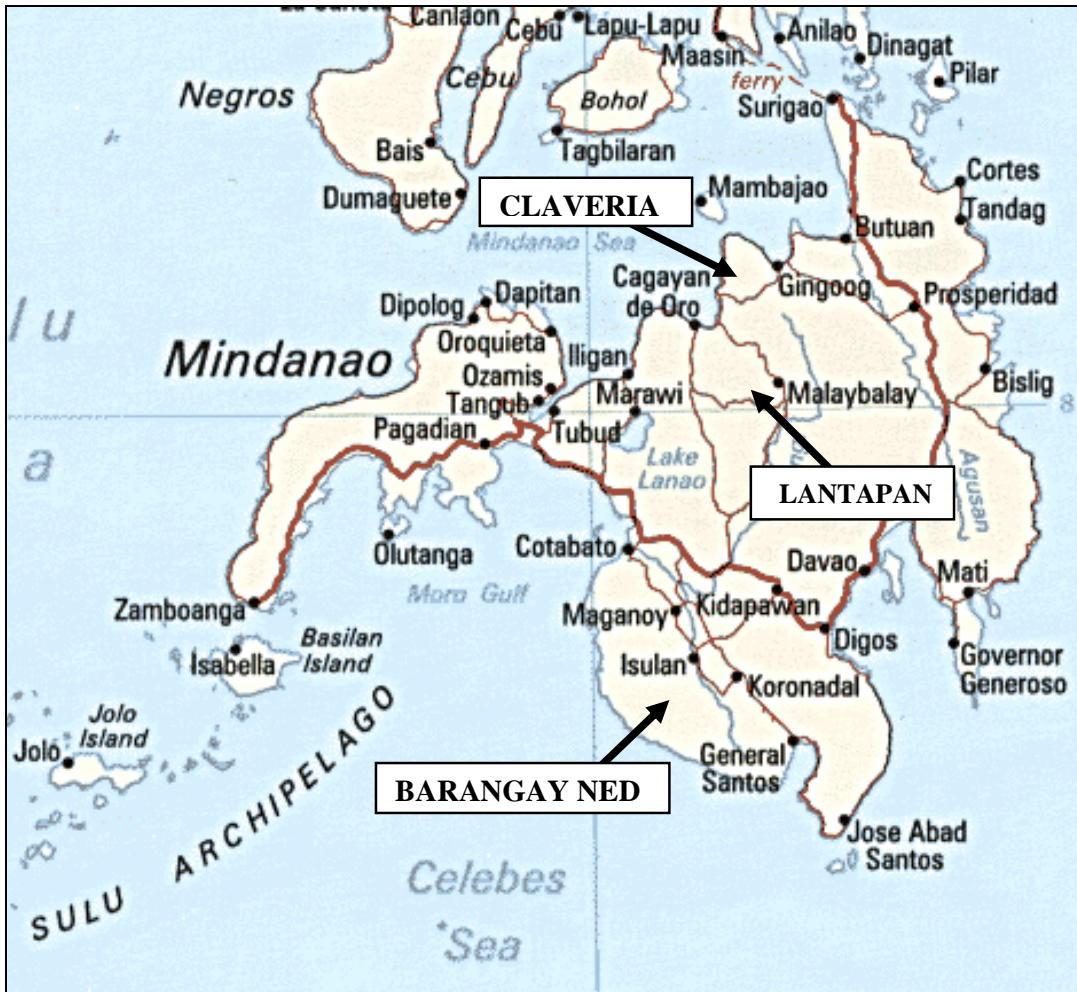
Fig. 1 Location of core Landcare sites in Mindanao, established between 1996 and 1999.