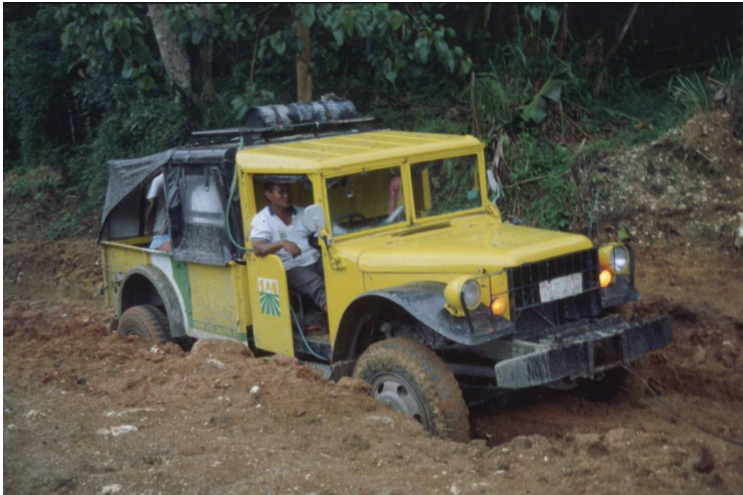
Fig. 8 Access to Barangay Ned is via a former logging road and is time-consuming, costly and unreliable. This limits the market potential for Ned farmers, as well as making it difficult to use Ned as a “demonstration site” in the same way as Claveria and Lantapan.

Though indigenous farmers once practised shifting cultivation of upland rice, the farming systems of both indigenous and migrant farmers now involve continuous cultivation of maize and (to a lesser degree) rice. Use of hybrid maize seed and inorganic fertiliser is increasing. The typical cropping pattern involves two crops per year, with upland rice or maize cultivated in the first season and maize in the second. Maize is mainly cultivated for sale, while upland rice is mainly for home consumption, though maize is also consumed as a staple. Neither maize nor upland rice cultivation involved the use of soil conservation measures until NAIDP's introduction of contour hedgerows (SALT) in the mid-1990s, which over 100 farmers had at least partially adopted.