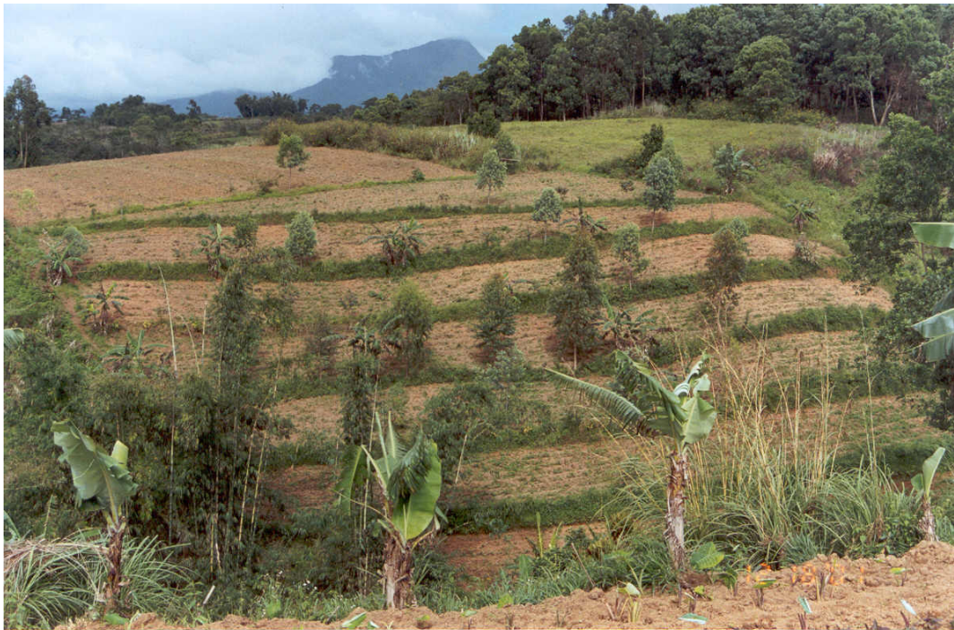
Fig. 7 Enrichment of NVS with tree species in Lantapan.

Combining adopters of the two main conservation measures – contour barriers and agroforestry – there were about 862 adopters by the end of 2002, or 16 per cent of the total number of farm households in Lantapan (though not all households were potential adopters). The total area under conservation measures was about 1,150 ha (43 per cent under NVS and 57 per cent under agroforestry), or about 1.3 ha per adopter. This was 7 per cent of agricultural land, 14 per cent of maize and vegetable land, and 23 per cent of “environmentally critical” land, suggesting a significant impact at the landscape level.