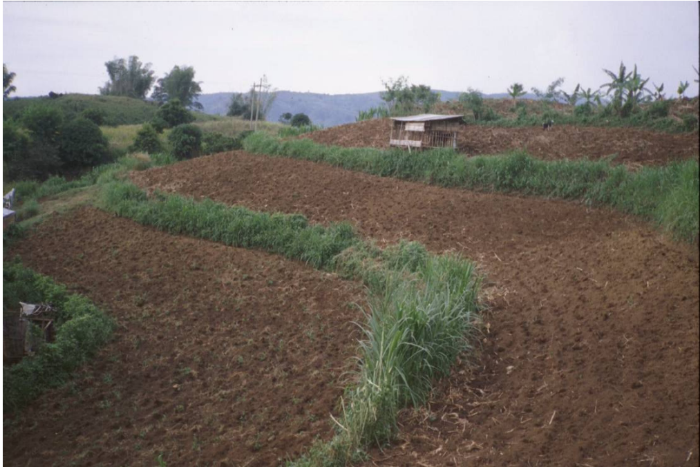
Fig. 9 Contour strips of forage grasses in Malitbog, introduced through the Forages for Smallholders Project.