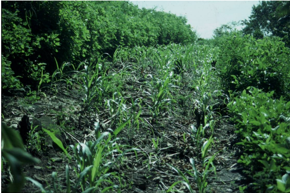
Fig. 3 SALT demonstration farm at the Mindanao Baptist Rural Life Centre in Bansalan, Davao del Sur, showing maize growing in the alley between hedgerows of shrub legumes. The hedgerows are pruned at frequent intervals and the prunings placed in the alley to add nitrogen and provide mulch. The system is designed to use few external inputs but adoption has been hampered by limited access to planting materials and the high labour (and skill) requirements for establishing and maintaining the hedgerows. Farmers who have adopted SALT have invariably adapted and simplified the technology. NVS is one such adaptation.

adoption of SALT. Six farmers were sent to Cebu for training in the methods of establishing contour hedgerows and, between 1987 and 1989, these six trained another 175 farmers in seven farmer-to-farmer training sessions. By 1992 up to 80 farmers had adopted the technology. However, widespread and sustained adoption of the SALT package in Claveria was limited by the same factors that had inhibited its uptake in other sites throughout the Philippines, notably the high labour and skill requirements for establishment and maintenance, combined with the short-term opportunity cost of foregone production.